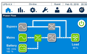
User Friendly 5" Touch Panel

All specifications are subject to change without prior notice.