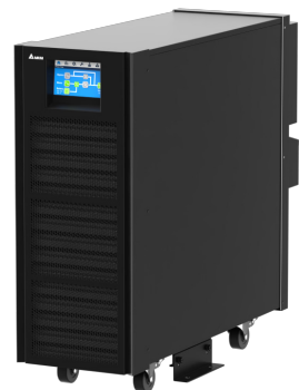
Optional IP42 solution