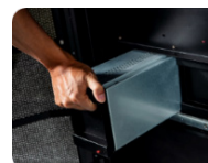
All-in-one solution (available for 60kVA system) & Modular battery cabinet with swappable battery modules