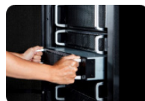
Hot-swappable modules for meet almost zero downtime