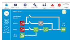
10" colorful touch panel at a glance view for friendly indicator