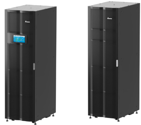
DPH 208V UPS