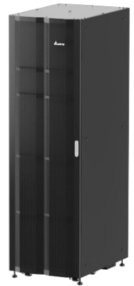
Modular battery cabinet