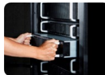
Hot-swappable modules for meet almost zero downtime