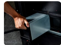
All-in-one solution (available for 60kVA system) & Modular battery cabinet with swappable battery modules