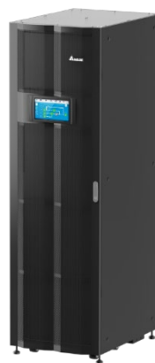
DPH 208V UPS