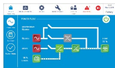
10" colorful touch panel at a glance view for friendly indicator.