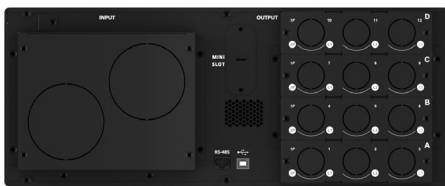
Rear panel (with cover)