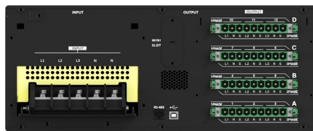
Rear panel (without cover)