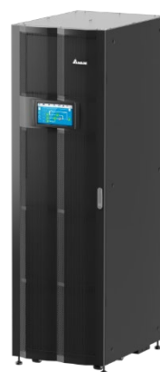
DPH 208V UPS