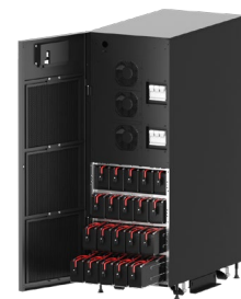
Inbuilt battery models with swappable battery trays design