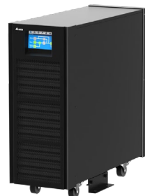
Optional IP42 solution