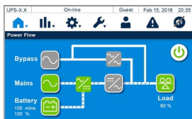
User Friendly 5" Touch Panel

All specifications are subject to change without prior notice.