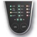
Friendly LED Display

* Lower range 80 ~ 176 Vac is acceptable under 50 ~ 100% loading condition. All specifications are subject to change without prior notice.