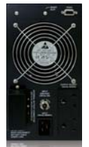
2 and 3 kVA Rear View