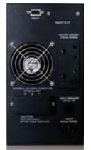
1 kVA Rear View