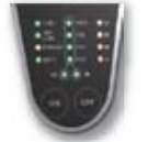
Friendly LED Display

* Lower range 80 ~ 176 Vac is acceptable under 50 ~ 100% loading condition. All specifications are subject to change without prior notice.