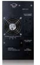
1 kVA Rear View