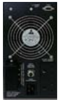
2 and 3 kVA Rear View