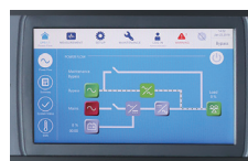
User-friendly 10" color touch screen