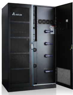
DPS series 500-1200kVA is highly integrated with four built-in switches