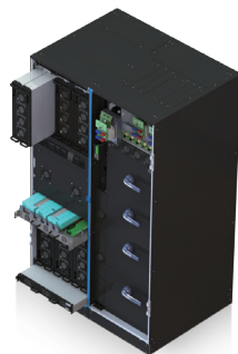
Fully front access and modular design of key components simplifies maintenance and shorten the mean time to repair (MTTR)