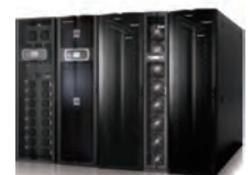
The Modulon DPH is designed in modern IT aesthetics aligned with Delta InfraSuite datacenter solutions.