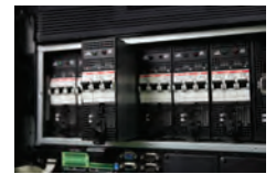
Optional Rack-Mount PDC with hot-swappable breaker modules and control modules