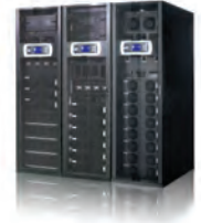
Full range of power ratings ideal for small and medium datacenters

All specifications are subject to change without prior notice.