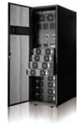
Scalable and hot-swappable power modules