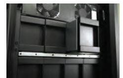
Optional hot-swappable battery modules