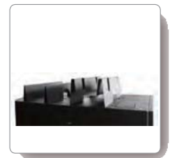
Roof Cable Trough