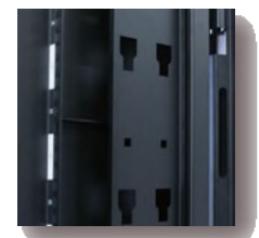
4 Universal Mounting Brackets